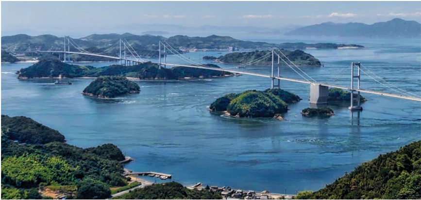
The longest bridge in the world that is equipped with both expressway and railway